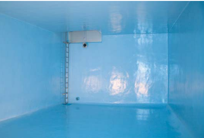
Lined concrete drinking water reservoir