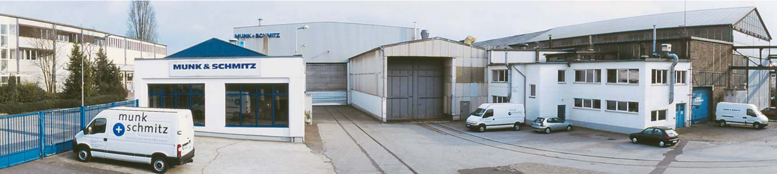
View of the Munk + Schmitz production and development facilities

Founded in 1890 Munk + Schmitz originally built apparatus and tanks for the chemical industry. Later on, the activities focussed on the production of large tanks for the beverage industry.