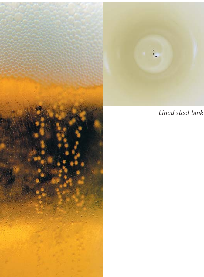
Lined steel tank